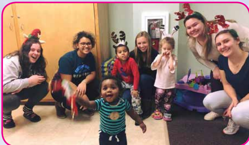
Collegiate Academy Students came to Mercy Center for a Christmas activity with the kids.