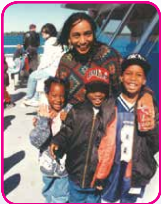
1996 Family Fun Cruise