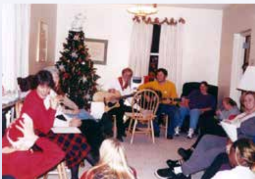
2002 Christmas Carols in the Living Room