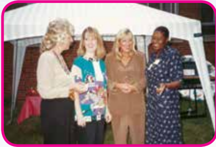
1994 Garden Party at the Center