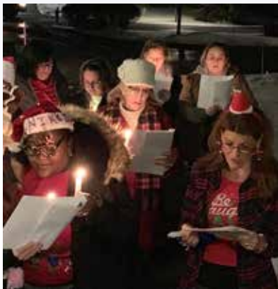
2018 Sharing the Joy of the Christmas Season with the Erie Community