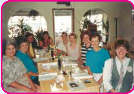
1993 Self-Esteem Class Dinner