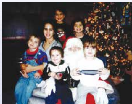
2000 Christmas with Santa