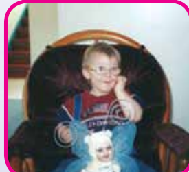
2002 Little Boy and His Doll