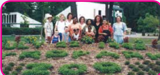
1998 Cleveland Zoo Field Trip