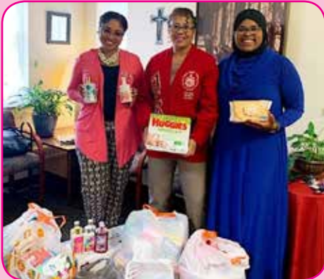
Ladies from Alpha Kappa Alpha Sorority, Inc., Mu Nu Omega Chapter, Erie Alumnae Chapter of Delta Sigma Theta Sorority, Inc. and Zeta Phi Beta Sorority, Inc., Rho Sigma Zeta Chapter generously donated personal care and baby items.

NonProfit Org. U.S. Postage PAID Erie, PA Permit #199