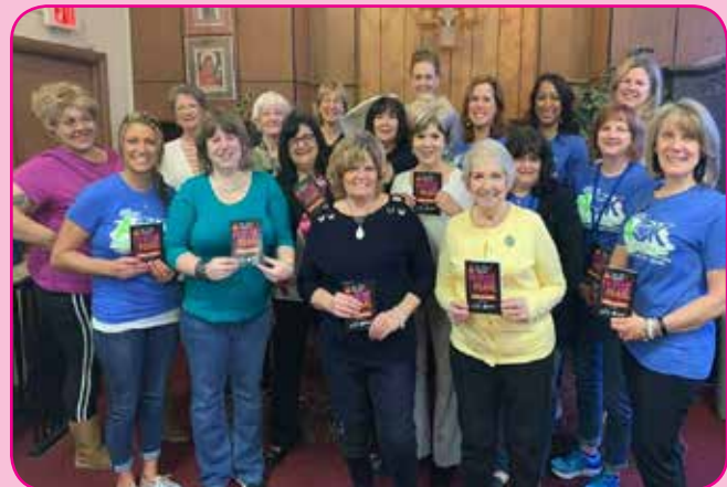
Our lovely volunteers help prepare the invitations for our Purse & Pearl Luncheon.