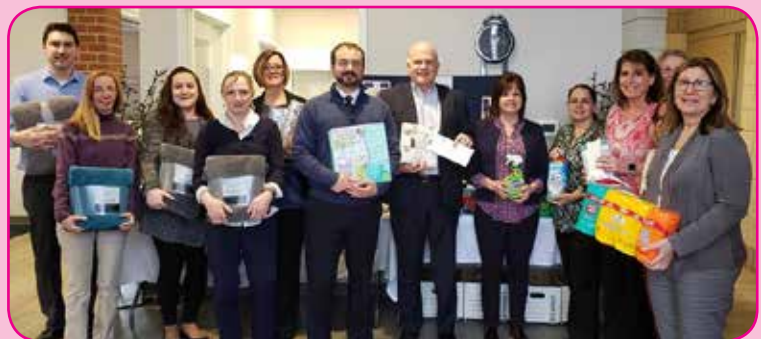
Boetger Acquisition Corporation employees presented a generous check and assorted items to Mercy Center