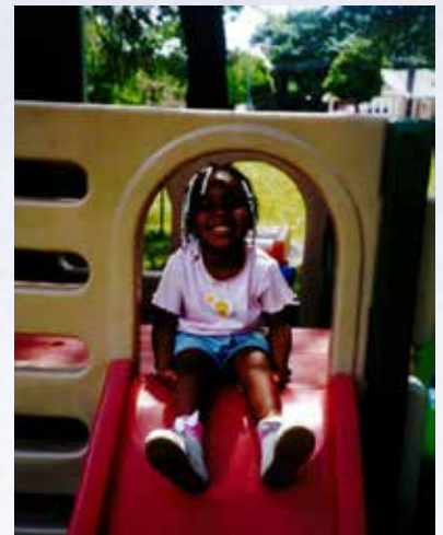
2001 Little girl enjoying the slide - wonder what great things she is doing now?

Thanks to a grant from the UPMC Health Plan through the Neighborhood Assistance Program, the restrooms on the main floor were upgraded including a new bathtub which is especially helpful for the moms to bathe their little ones, as well as a secure changing table.