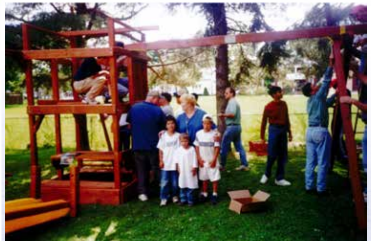
GE Elfuns built the current playground in 2000.