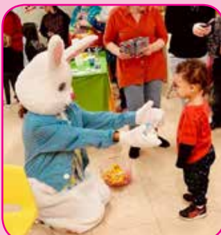
The Easter Bunny hopped by the MCW to see the children.