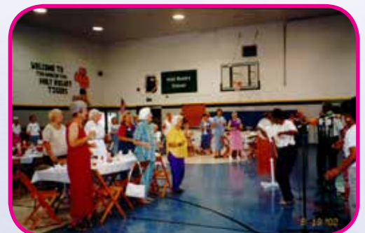
Alumnae Dinner 2002 held in the Holy Rosary School Gymnasium.

It's time again to honor 12 Dynamic Women in the Erie Community. If you know a woman who has made a difference in the lives of others, has overcome difficult circumstances and volunteers to make life better for others, go to our website and nominate her. The Women Making History Program will be held on March 4, 2020 at the Mary D'Angelo Performing Arts Center.