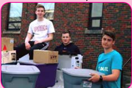
Cathedral Prep students spent their “Day of Service” helping at the MCW and Dress for Success Erie.

The most beautiful things in life are not things. They’re people and places and memories and pictures.