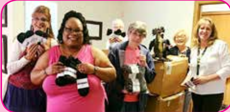
Bombas donated 13 cases of socks to the women and children of the Mercy Center!